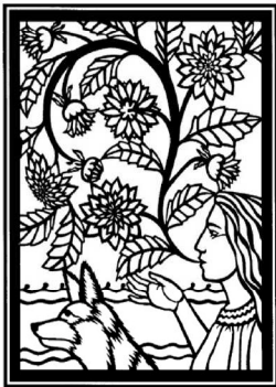
Illustration by Carmen Lomas Garza

Students were reading John Steinbeck's novel, "The Pearl", based on an ancient Mexican legend. In their language arts class they were given a scene from the novel, and asked to write a narrative poem of the dramatic moment, evoking the mood and cultural rhythms of the novel.