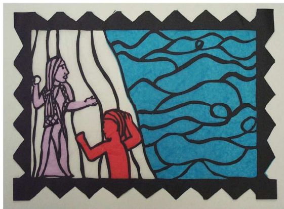
Heritage Middle School