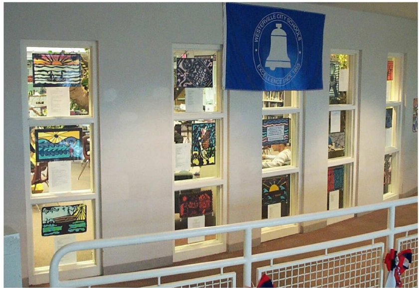
Final illustrations with accompanying poems were displayed in the media center windows, and glowed like stained glass windows!