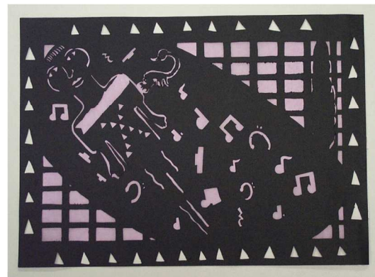
The use of background "connectors" throughout the illustration was very important to hold the paper together and give it a strong sense of design.